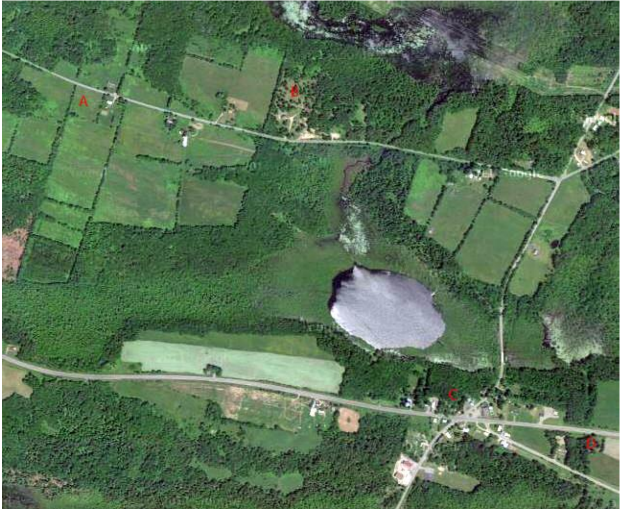
Google Satellite image of Amboy Center, Hotel Pond and Foil Road

Because the area has undergone little further development since 1867, many roads and farms shown on the 1867 plat map also appear where we would expect them to on the Google Satellite image.