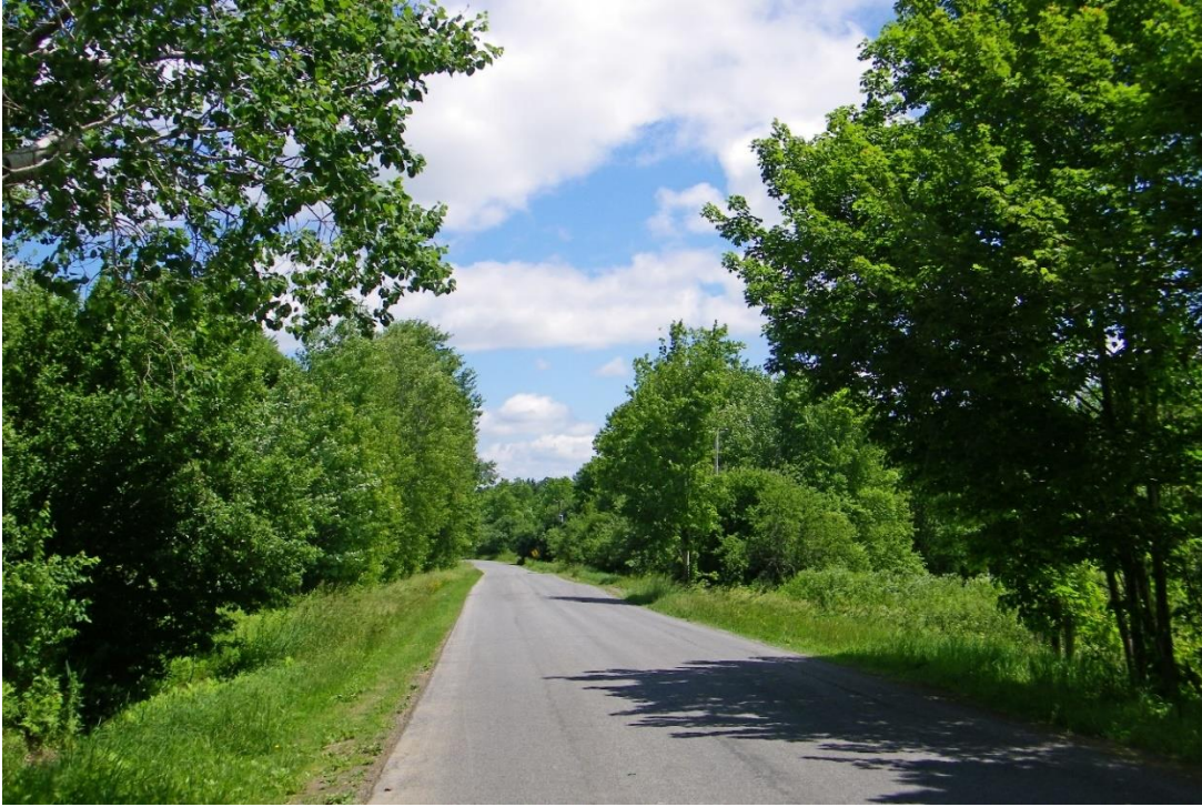
Foil Road in 2012