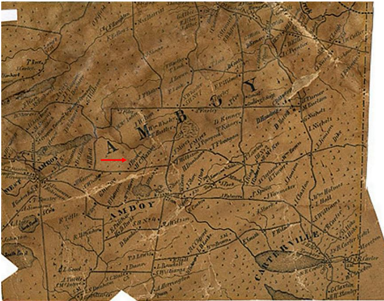
Undated Plat Map of Amboy Township